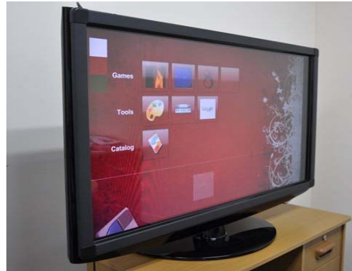
SmartFrame fixed onto an LCD screen

Turn an existing dull screen into a SMART, interactive, multitouch-recognizing tool